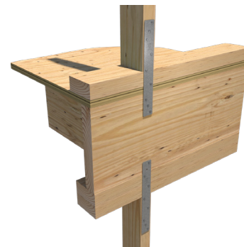
CDLS Series Installation