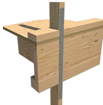
CDLS Series Installation